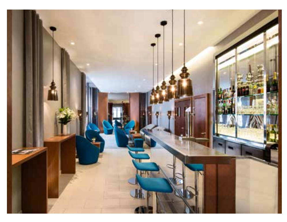
Above Hotel restaurant featuring Fabbian's Lamas pendants Left Contardi's Cornelia pendants suspended above the bar.

mediately placing visitors into a welcoming and comfortable environment. The custom made reception desk has been designed with an integrated LED lighting feature. The butterfly pattern symbolises spring and spreads out with finesse on the reception desk, with a backlight giving a fine and elegant appearance. This is a stylistic signature of Axel Schoenert architectes that can be found in many of their projects. Moving up to the hotel's bedrooms, Spanish designer Patricia Urquiola's Tatou S1 suspension lamps from her Tatou collection for