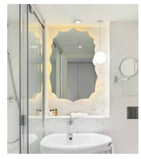
Left Floor and suspension lamps from Patricia Urquiola's Tatou collection for Flos, with Lumina's Flo lamp featured on the desk under the TV. Above DMP's LED suspension lamp designed by Varnagy illuminates the bathroom.

cosy light for a gentle dining ambience. The bar's lighting also generates a comfortable and intimate atmosphere, while keeping the overall spirit of spring, with Italian lighting designer Contardi's Cornelia collection of ceiling lights above the counter.